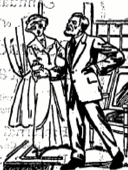
"Every Picture Tells a Story"

Doan's Kidney Pills are the best-recommended and most widely used remedy for weak or diseased kidneys. They act quickly; contain no poisonous nor habit-forming drugs and leave no bad after-effects of any kind—just make you feel better all over.